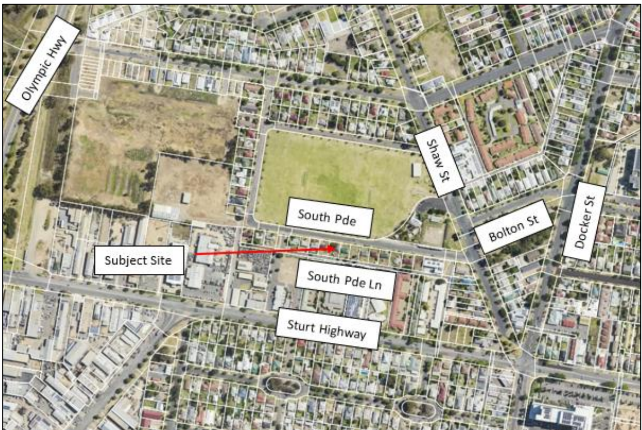
Figure 4-1 Existing Road Network