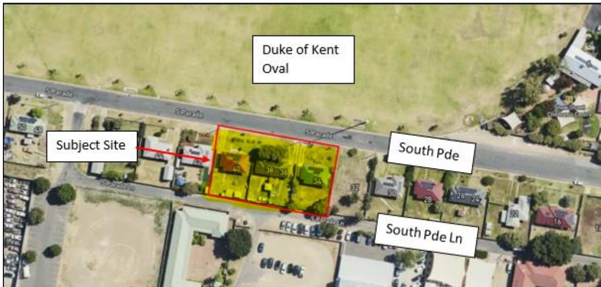
Figure 1-1 Immediate Locality of Sites

34-40 South Parade (Lots 4, 5, & 6 DP35910), herein referred to as the 'Subject Site' is located within Central Wagga Wagga, to the west of the Central Business District (CBD). The Subject Site consists of three separate lots with a combined area of approximately 1,515m 2 . Figure 1-1 and Figure 1-2 shows the locality of the Subject Site within their immediate and extended context, respectively.